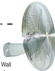
IAC-WB Wall Bracket