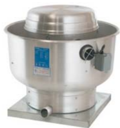
Models CBU, CBU-HP Belt Drive Upblast; CDU Direct Drive Upblast / Wall

Contact Bearing Distributors for availability