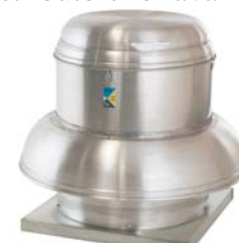
Model CBD Belt Drive Sizes 13" through 36"