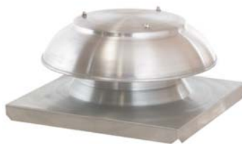
Model ARD Propeller Rooftop Sizes 10" through 18"