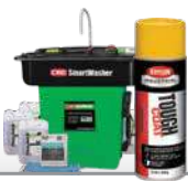
Cleaners & Chemicals