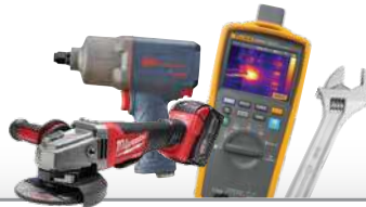
Hand, Power & Analytical Tools