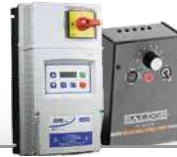
Motors & Controls