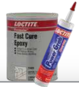
Adhesives & Sealants