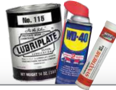
Lubricants & Equipment