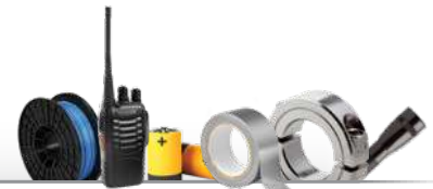
General Industrial Supplies