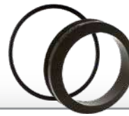
Seals & O-Rings