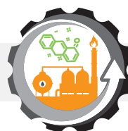
Chemicals & Petrochemicals