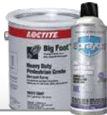
Coatings & Paints